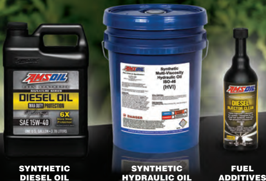
SYNTHETIC DIESEL OIL