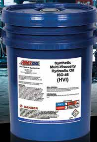
SYNTHETIC HYDRAULIC OIL