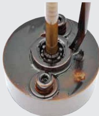
LEADING CONVENTIONAL HYDRAULIC FLUID (ISO 46)