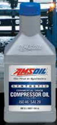
SYNTHETIC COMPRESSOR OIL