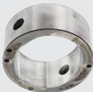
VANE PUMP CAM RING

Order by Phone 1-800-956-5695 - Give Operator Reference #1948371