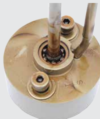
AMSOIL SYNTHETIC MULTI-VISCOSITY HYDRAULIC OIL (ISO 46)