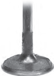
Intake Valve after P.i. Treatment