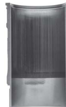
Severely Scuffed Liner