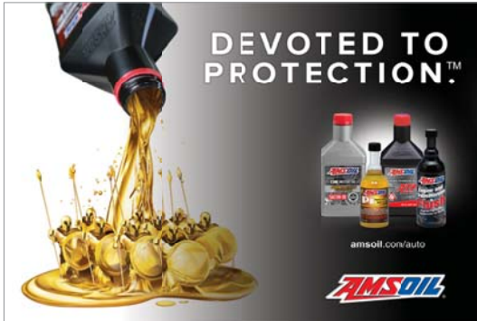
Retail Counter Mat (G3351)