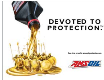
Window Decal 9"x12" (G3356)