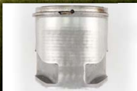
Virtually No Wear/Deposits